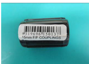
19. 1 x F-F-Coupler BSP 1-2IN 15mm