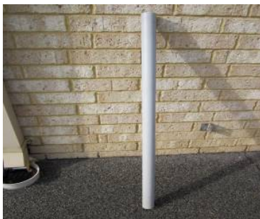
7. 1.3m PVC Pipe dia 50mm