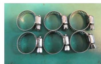
21. 6 x Hose Clamps 8-22mm