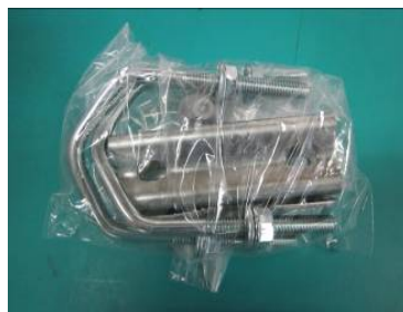
5. 2x U-Clamps, 2x Saddle Clamps and 1 x EN-GLAND-FB-5-7-BL