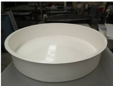
1. 6529C Evaporation Pan Drilled one hole

Please refer this document to the list of parts supplied in the Unidata 6529-2 Evaporation System kit of parts. This makes part identification much simpler.