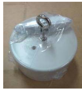
9. 6541F-115 Float