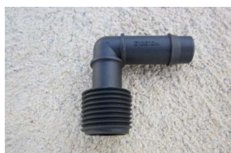
20. 1 x 13mm Barbed x 15mm BSP Male Threaded Elbow