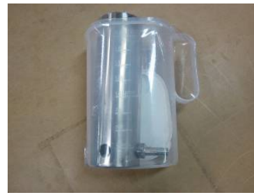
3. 6529M 100mm Point Gauge with 2l Jug