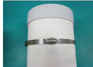
12. Stillwell Clamp 114-165mm