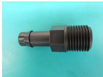
17. 1 x 13mm Tail 1-2IN BSP Male Director