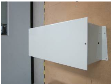
4. 6706A Aluminium Enclosure