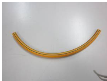
14. Hose 13mm Yellow 425mm Length