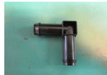
18. 1 x 13mm Barbed Elbow