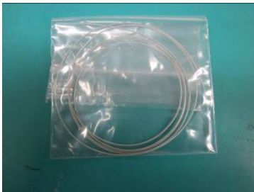
10. 6541E Unbeaded Floatline