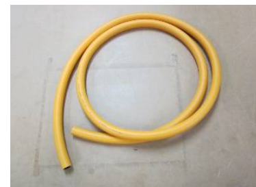
15. Hose 13mm Yellow 1.8m Length