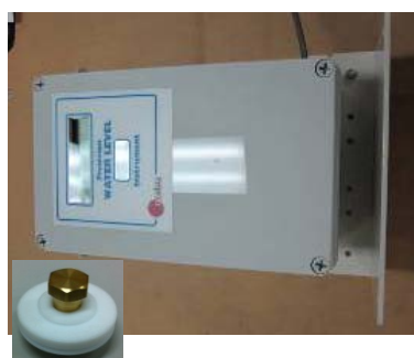
8. 6541C-31-C WLI with 6541O