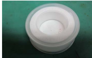
23. 1 x Thread Tape