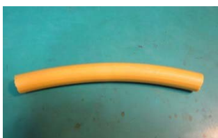
22. Hose 13mm Yellow 180mm Length