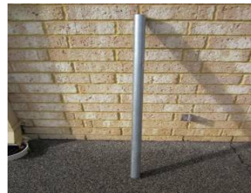
6. 6706A-POLE 1.3m Pole Mounting Dia 40mm