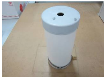
11. 6529G Stillwell