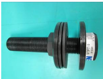
16. 1 x SFTF15 15mm Female Fitting Tank with Gasket