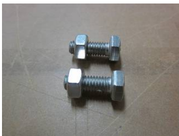
13. Stillwell M6x16 Screws & nuts installed on the top cap of the 6529G