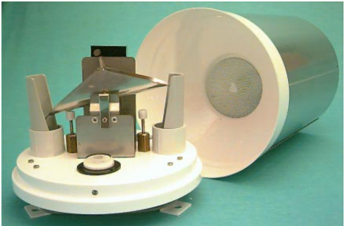
Model 6506A Tipping Bucket Rainfall Gauge

Up to four units may be connected to the Data Logger at any one time.